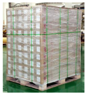
Boxes on a pallet