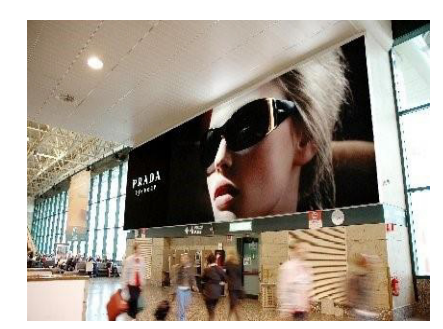
Advertising images for shops