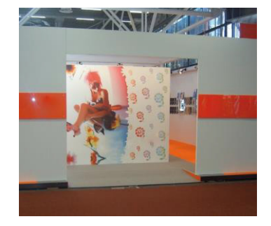
Trade exhibition stand customisations