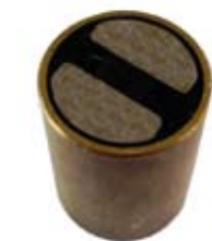
Core 3: Alnico medium performance, Tmax 500 °C, waterproof.