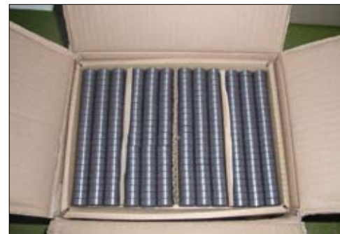
BULK: in boxes.