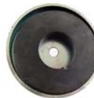
Core 4: Ferrit low performance, Tmax 200 °C waterproof.