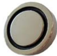
Core 1: Neodymium high performance, not waterproof.

Core: Neodymium, Samarium Cobalt, Alnico, Ferrit.