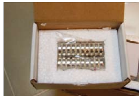
UNIT BOX: Packing boxes and then type beehive.