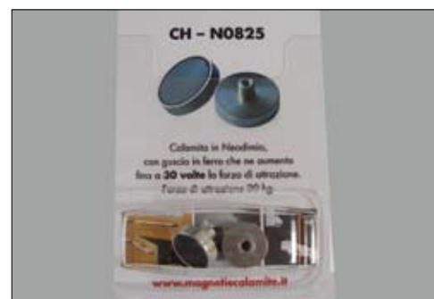
SINGLE PACK: do it yourself Packaging for large-scale retail trade.