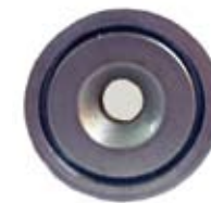
Core 2: Samarium Cobalt performance, Tmax 350 °C, not waterproof.